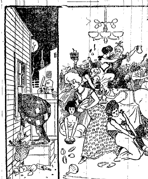
THE TWO STANDARDS OF DISHONESTY.

This leads to a fine of $25 and costs $10.